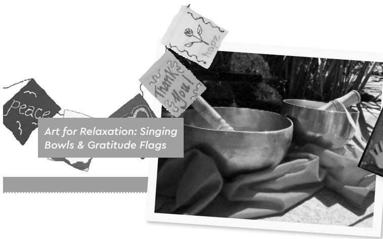
Art for Relaxation: Singing Bowls & Gratitude Flags