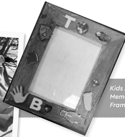
Kids Art: Memory Frames