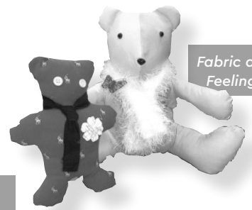
Fabric and Feelings