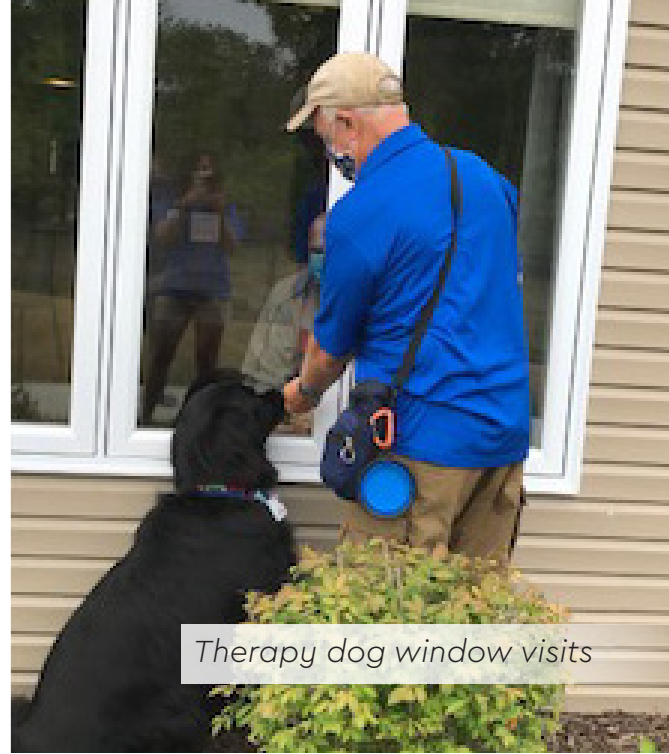
Therapy dog window visits