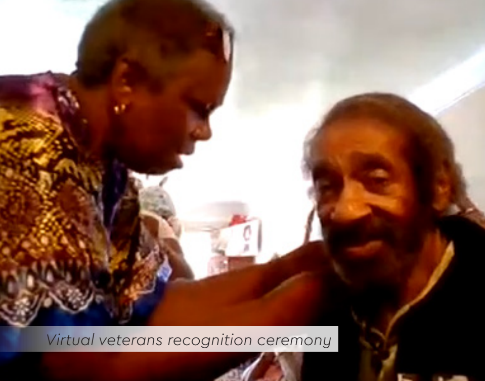
Virtual veterans recognition ceremony