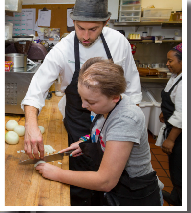
From top left...Lesson one: Chicken Piccata; Lesson two: knife skills; Lesson three: dessert course

The two chefs at the five-star restaurant in Beachwood not only provided Kayla with three private