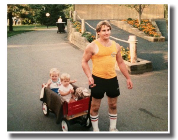
Dad, my sister and me

You do not recover from losing a parent. You can only reflect, learn, love and push forward. This record is a time capsule of my experience, for the good and for the bad. It is an avenue for my emotions, anger,