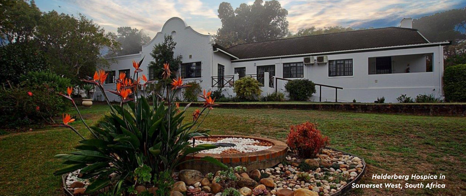
Helderberg Hospice in Somerset West, South Africa